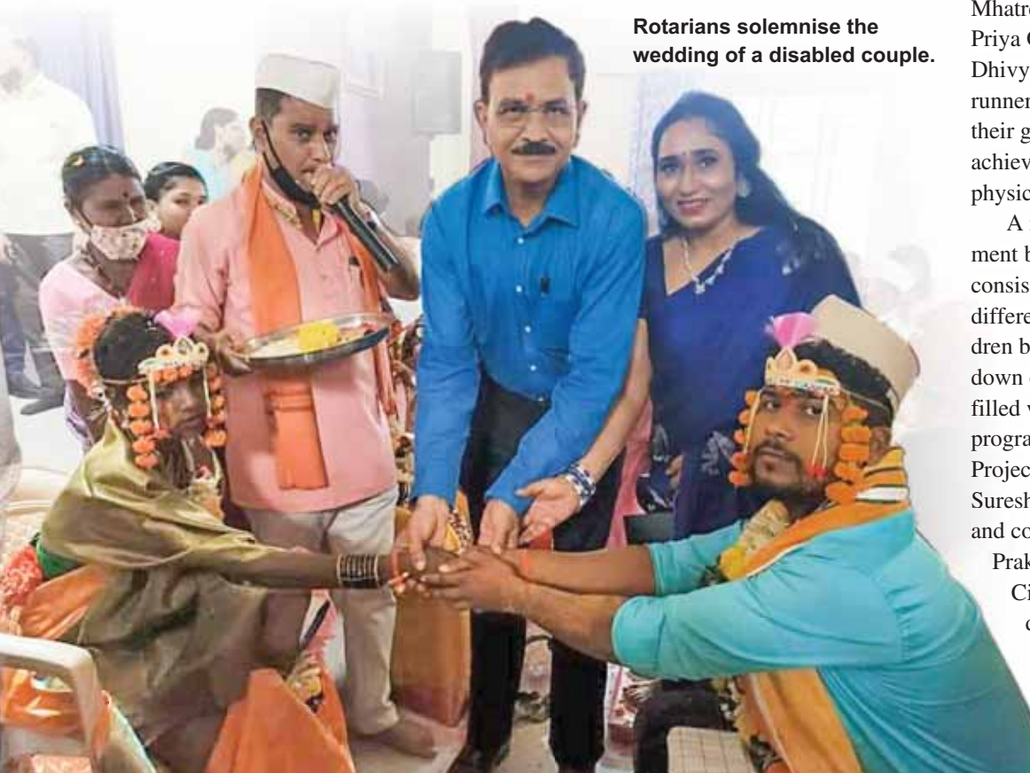
Rotarians solemnise the wedding of a disabled couple.