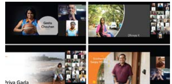
Felicitating the special differently abled ones virtually

Rotary Club of Palghar supported the wedding of five disabled couples