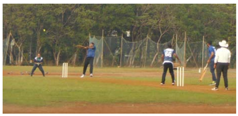
Following two years of sabbatical, sporting activities resumed in city. Photo shows action from a Navi Mumbai based Intra Office Cricket Match being played at NMSA Vashi on Saturday.